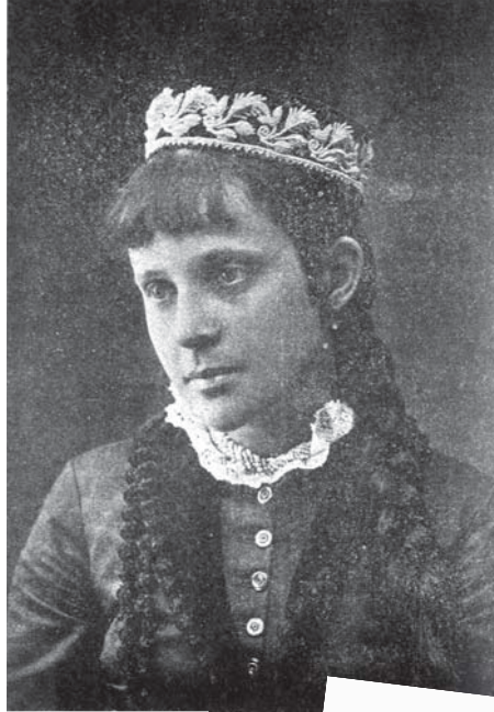
Shefika Khanim (1886–1975), chief editor of the first woman's journal, Alem-i Nisvan (Woman's World) and the most prominent women reformist in Muslim Central Eurasia. After she had to leave her homeland Crimea (late 1918) and also Azerbaijan (1921), she spent rest of her life in Turkey.