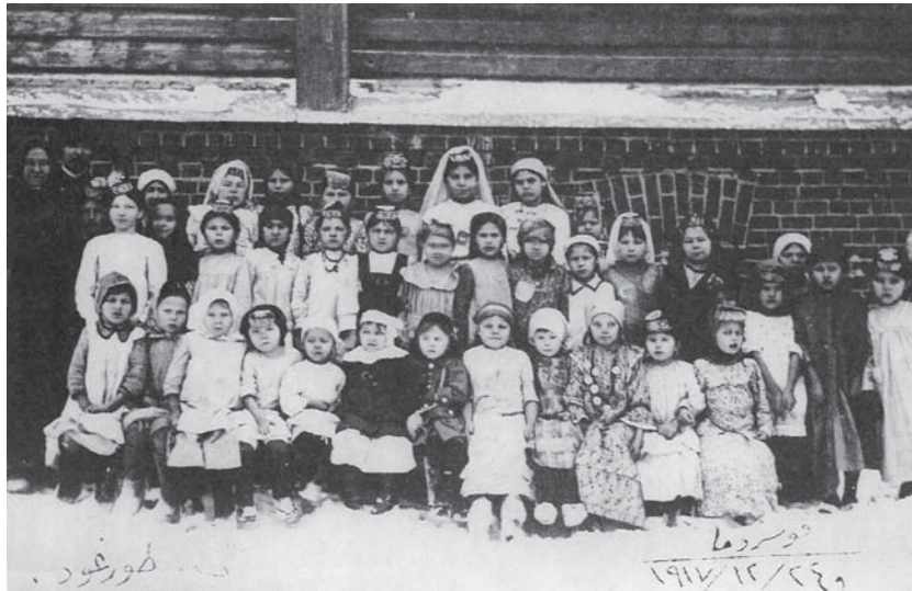
Girls elementary school in Kostruma (Siberia, 1917).