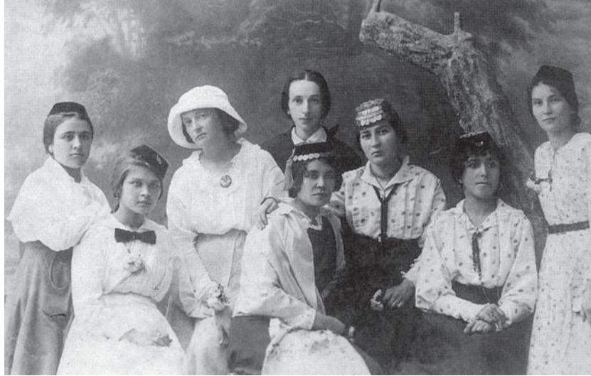
The Ayshe Ishakova Kindergarten-Teacher's Training School in Akmesjit (Simferopol) in Crimea (1917).

Transcaucasia was the most prosperous in terms of material wealth thanks to the advanced oil industry of Baku since the beginning of the nineteenth century. However, regardless of resources, between the 1860s and the 1910s, various groups of reformist intellectuals—among them scholars, journalists, writers, and politicians—had already started to engage in cultural, social, and political reform activities, particularly in the cities of Simferopol, Kazan, Ufa, Baku, Tashkent, Bukhara, and Samarkand.